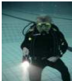
OK. All is well