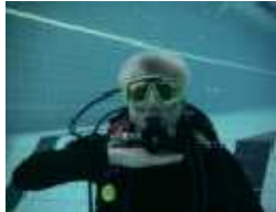
Out of air