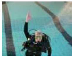
OK. At the surface