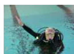
Distress at the surface