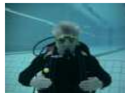
Out of breath