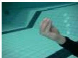
I don't understand