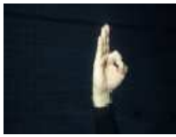
OK. All is well